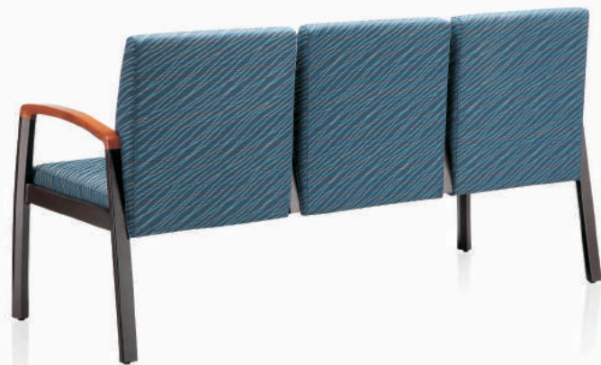
适用于 医疗 | 康复 | 养老 | 疗愈空间 Healthcare furniture | Elderly care furniture | Rehabilitation Center Furniture